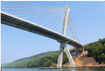
Lock of Guilly Glaz